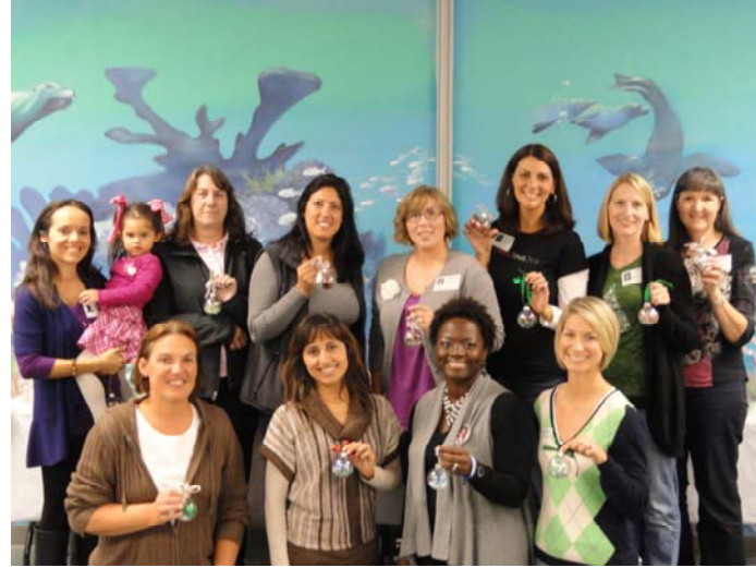
OKE OTA Board members enjoy the Volunteer Breakfast!!